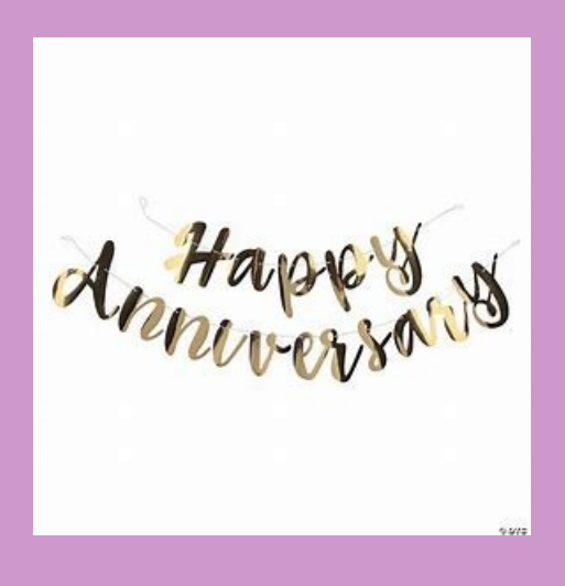
1/20 - Jim and Sheila Ely